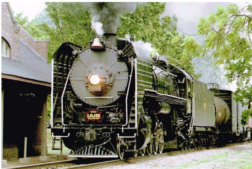
Iowa Interstate convention special photo run at Newton, Iowa