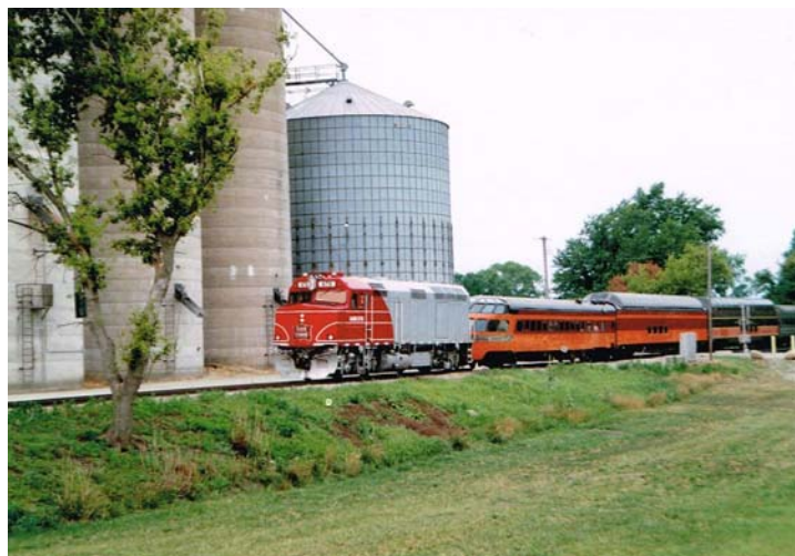
Convention special on Iowa Northern at Shellsburg w/ex-Amtrak F40PH