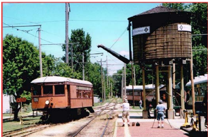
Former Charles City Western interurban car at Boone, Iowa

during his attendance at the NRHS Convention based in Cedar Rapids, Iowa.