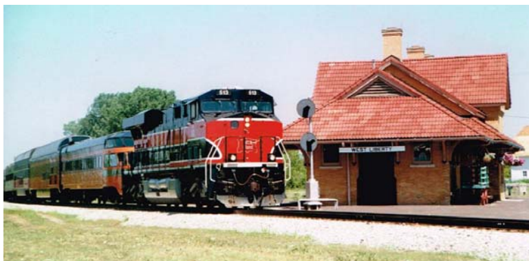
Convention special w/Iowa Interstate ES44AC-H in Rock Island scheme