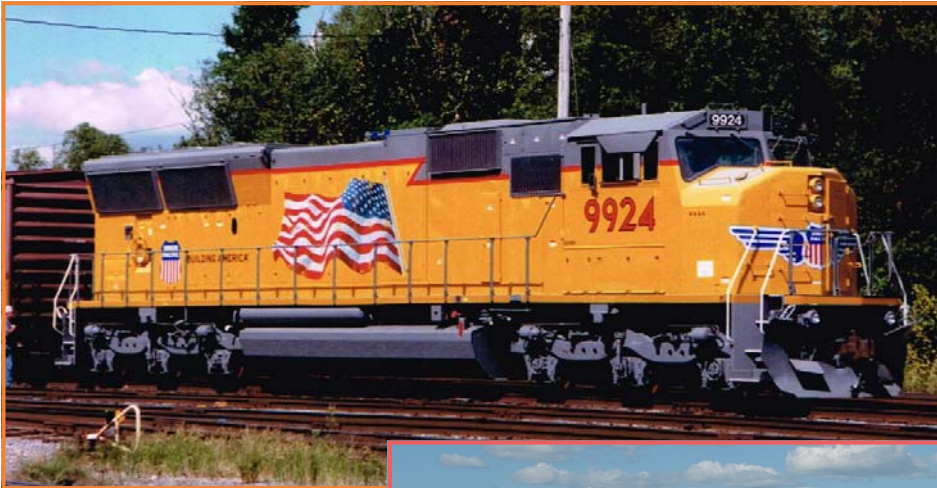
Left: Wallace Henderson got this photo of Progress Rail's "SD59Mx-2" rebuild of UP SD60Ms now 3000 HP in P&L's Paducah Yard.