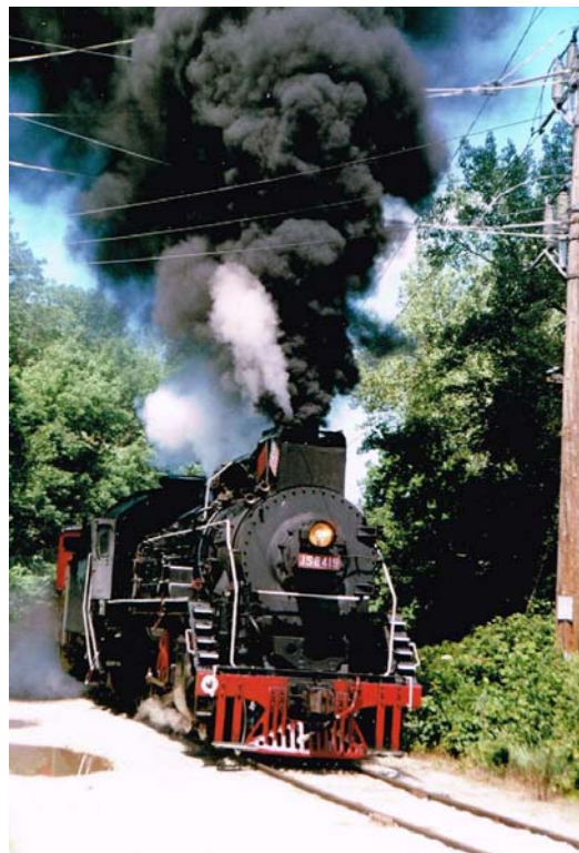
Boone & Scenic Valley convention photo